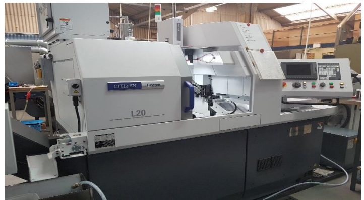
Citizen LRV technology

Being diverse in engineering is paramount