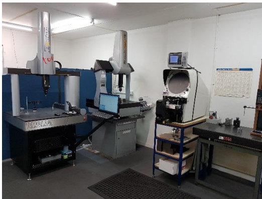
CNC CMM inspection Equipment